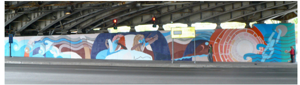
National Art Education Association Mural: Baltimore