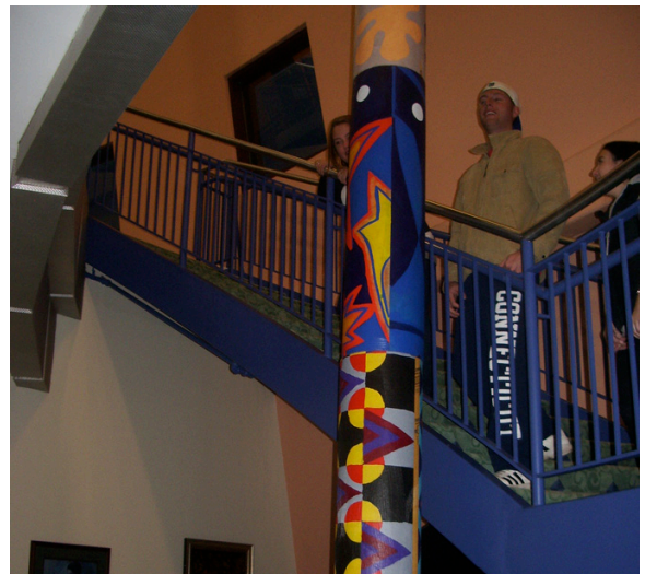
Research Art