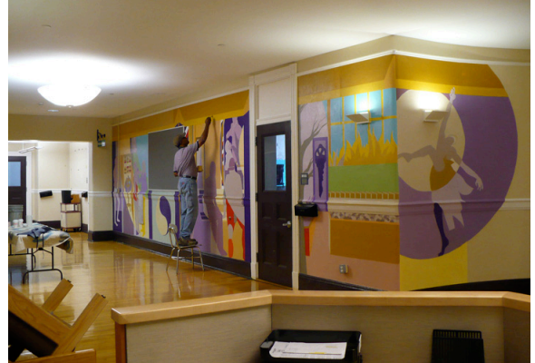
Noah Webster Mural