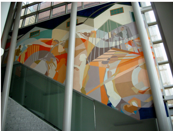
Naylor Mural