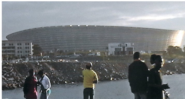
The Cape Town Stadium in Cape Town, South Africa from afar.

their jaws dropping in amazement, and Africa proud of herself. Do we have problems within the continent? Yes, we do, just as other continents. The problems may not be identical, and their weight on the continent may be heavy. But as one of the most popular adages of Africa puts it: The head of the elephant is as heavy on the head of the elephant as the head of the ant is on the ant.